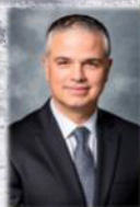
Rotary Club of Moun