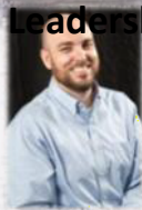
t Pleasant Social Media